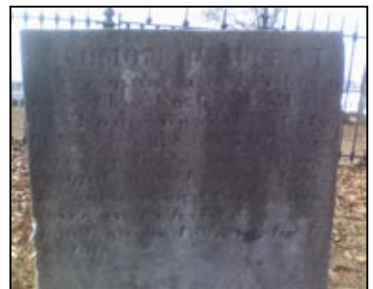
Soloman Perteat's tombstone.

(Left) Newtown map showing Perteat's Tanyard property.