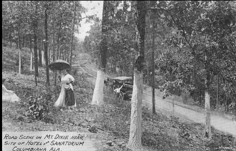
This photo and the drawings on page 2 are from the postcard collection of the Shelby County Museum & Archives