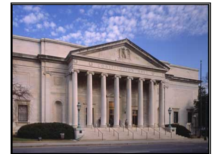
NSDAR Constitution Hall WEBSITES

DAR Web site: www.dar.org ASDAR Website: www.rootsweb.ancestry.com/~azsocdar Casa Grande Website http://www.rootsweb.ancestry.com/~azcgvdar/