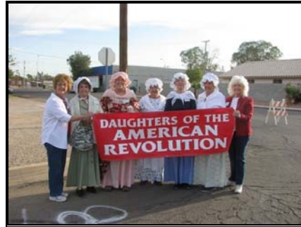
Chapter members participating in the 2009 Veteran's Day Parade in Casa Grande. November 2009