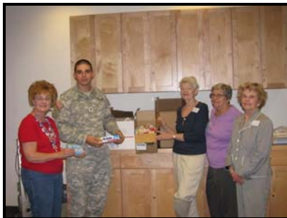
Chapter members present personal care items, books, candies, etc. for use by Arizona military personnel serving in Iraq and Afghanistan. November, 2009