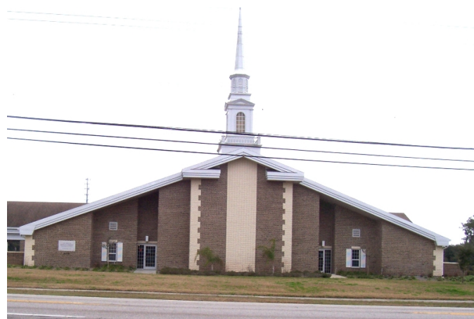
LDS Family History Center, 48 Bell Shoals Road

The Center has three rooms. As you enter, the first room you see has a large table at which you can sit with your own laptop and your documents. The code to their Wifi will be provided for you by the volunteer. A second room is a computer room with a few computers on which you can access the Salt Lake City site and get guidance from a volunteer if need be, especially if you are a beginner at using their site.