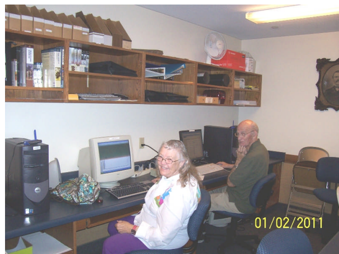
LDS Computer Room

On February 2, 2011, I drove to the Family History Center located at 48 Bell Shoals Road in Valrico, Florida. I wanted to know what was available at their site. The entire property at that site is considered a Stake of Jesus Christ of Latter Day Saints. The property itself is quite large. The Family History Center is only a small part of the entire complex. Standing in front of the facade of the property, the Family History Center has its own entrance on the right side of the building and a sign by the entrance door will lead you in.