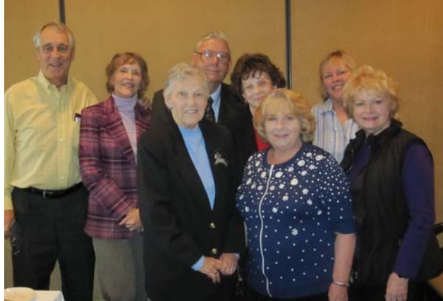
Fleur de Lis Chapter, January 15, 2010