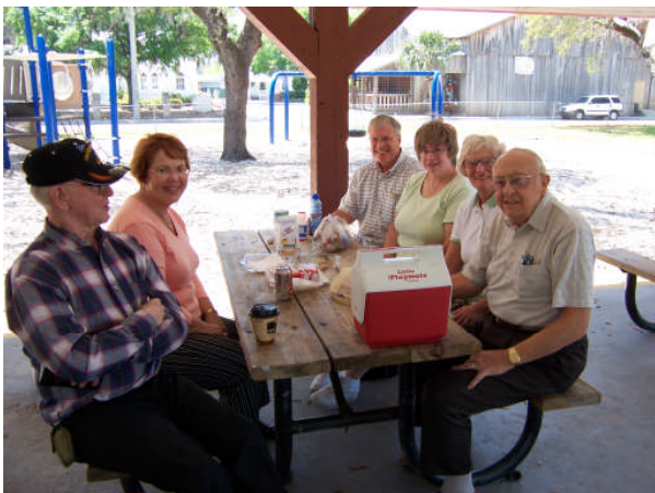
Some of our members enjoying a picnic lunch before touring the Palmetto Historical Park last May 2006!

End your experience here with a visit to Heritage Chapel. Built on-site, the Chapel is a composite of the three original churches in Palmetto. A simply beautiful building which is available for rental for weddings and other small family affairs.-