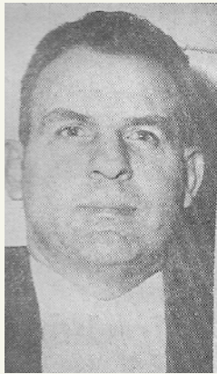
1961 Citizen of the Year