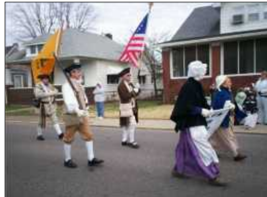
A chilly Boonville Holiday Parade