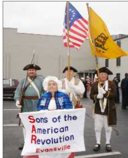
A blustery day in Owensboro, Kentucky