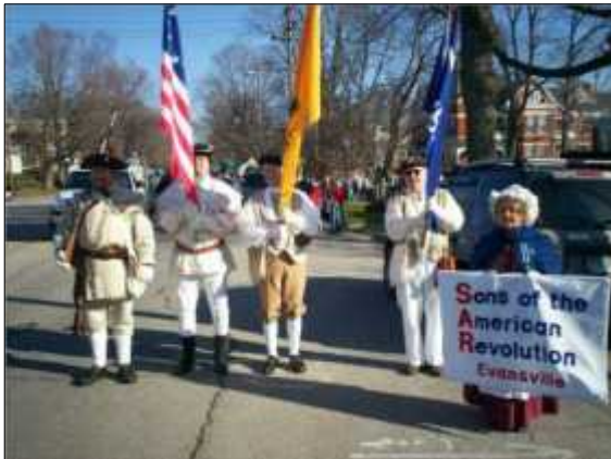
Waiting for the start of the Henderson Holiday Parade