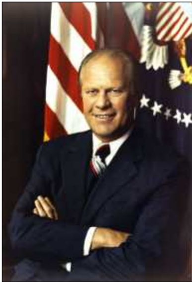
Gerald R. Ford (July 14, 1913 – December 26, 2006)