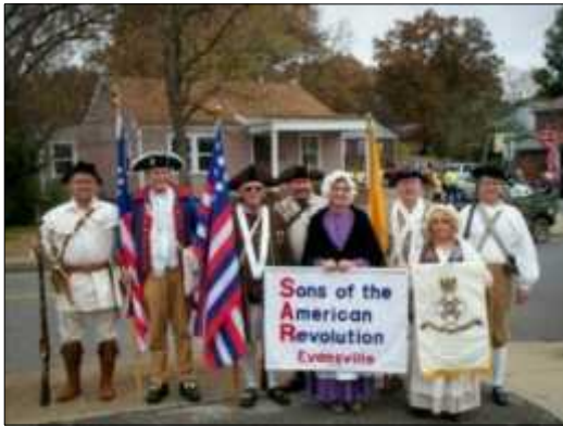
The Color Guard in Madisonville, Kentucky