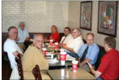
Chapter members enjoying an after-meeting lunch at Grandy's.

The next chapter meeting will be held August 25, 2007. The meeting was adjourned at 1 PM.