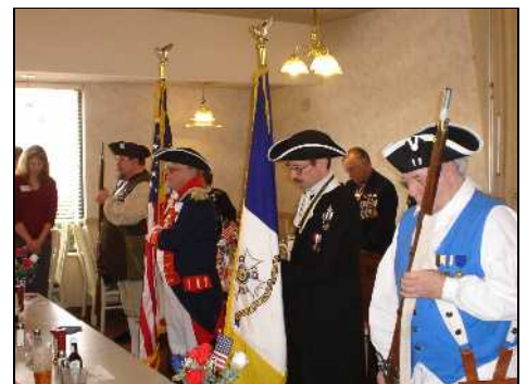
ABOVE and LEFT The Color Guard at the Ohio Valley Chapter Awards Banquet at the Sirlain Stockade.