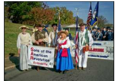
Madisonville Veterans Day Parade.