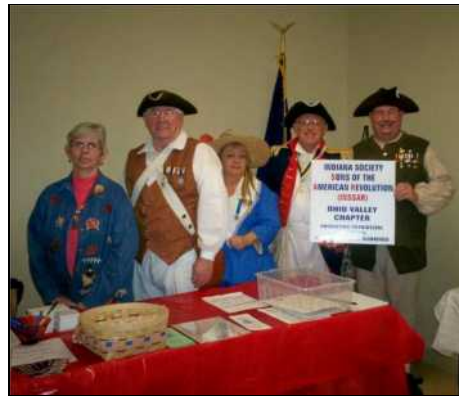
The SAR display at the Tri-State Genealogical Society Seminar