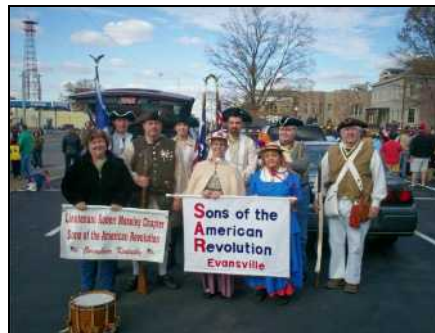
Owensboro Veterans Day Parade