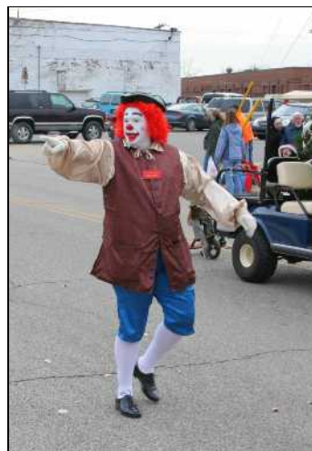
A Prospective Member?