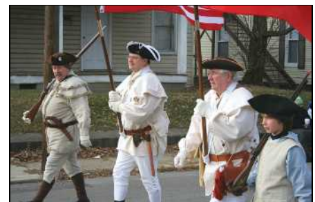
Boonville Holiday Parade