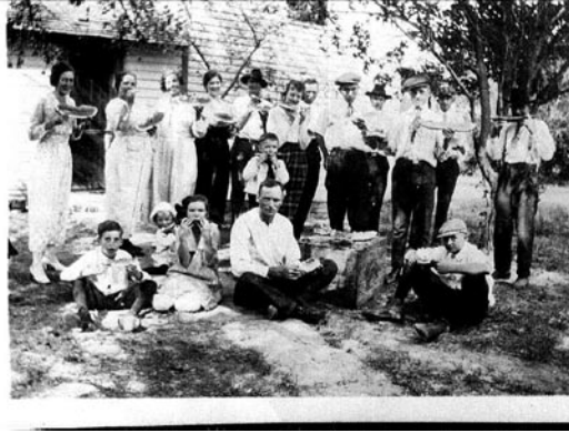
The Deans - 1912