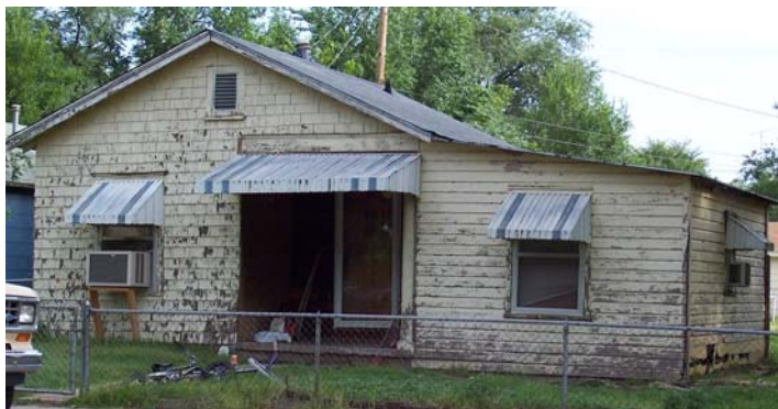
124 Park Street