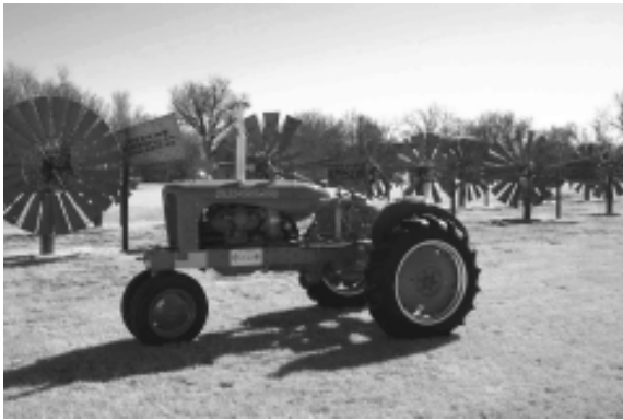
1947 W C Allis Chalmers Tractor

FEATURING: ALLIS CHALMERS TRACTORS & MACHINERY