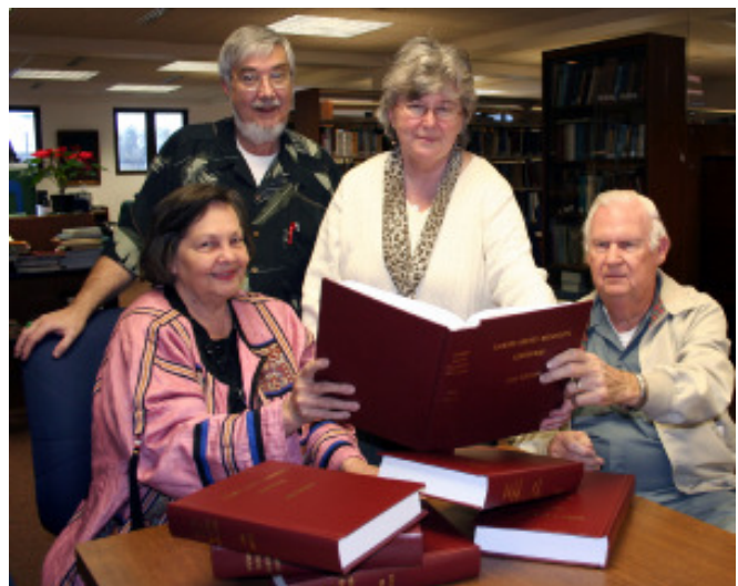
Members admire new Cemetery Book.