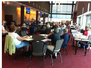
During the program