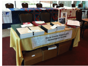
A County Display Table