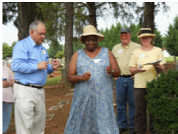
Non-technology – using divining rods to find graves