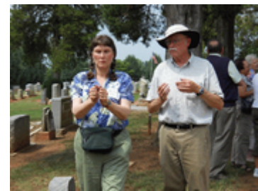
"Looks like it works!"