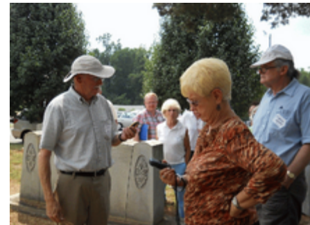
"Now how's this work?"