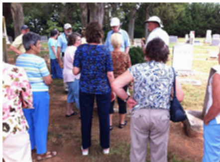
Cemetery Workshop about GPS and technology