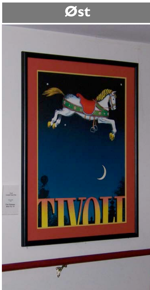
The poster that started this inquiry