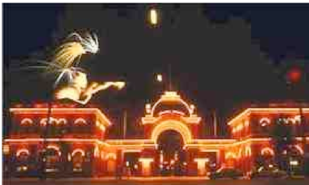
Fireworks at Tivoli Gardens in Copenhagen

Initially intended as a traveling exhibit, the grant was amended as a result of the Commission panel's suggestions. The DVD will not require a staff member to physically set-up the exhibit or to maintain it. It can be played on a DVD player.