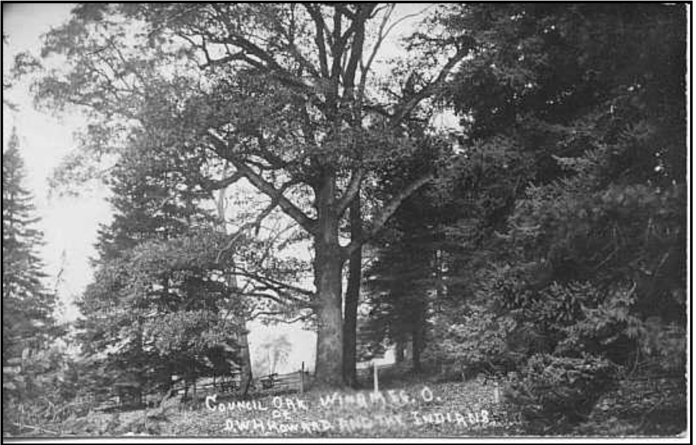
Among the picturesque hills shaded by the famous old Council Oak