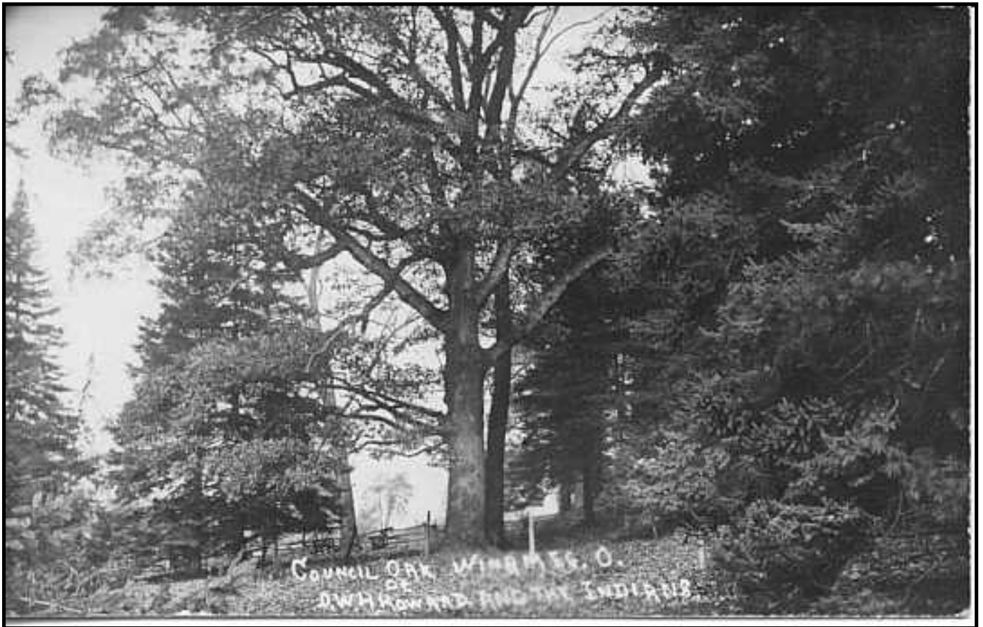
Among the picturesque hills shaded by the famous old Council Oak