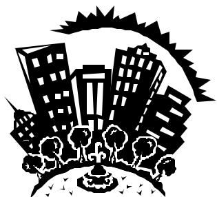
"An All Day Shopping Trip"

The spelling of Liesberg was changed to Leesburg in the late 1920's.