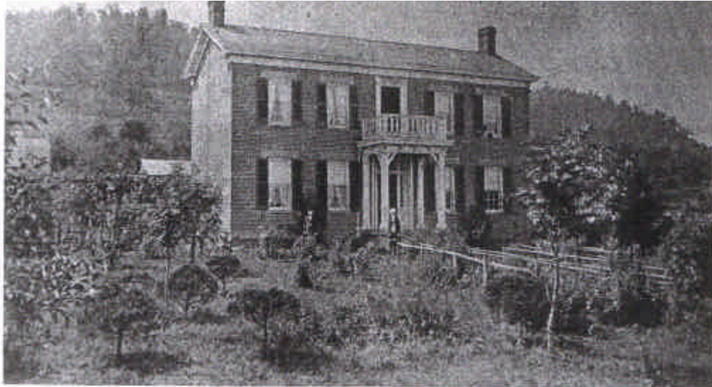
APPLETON FARM