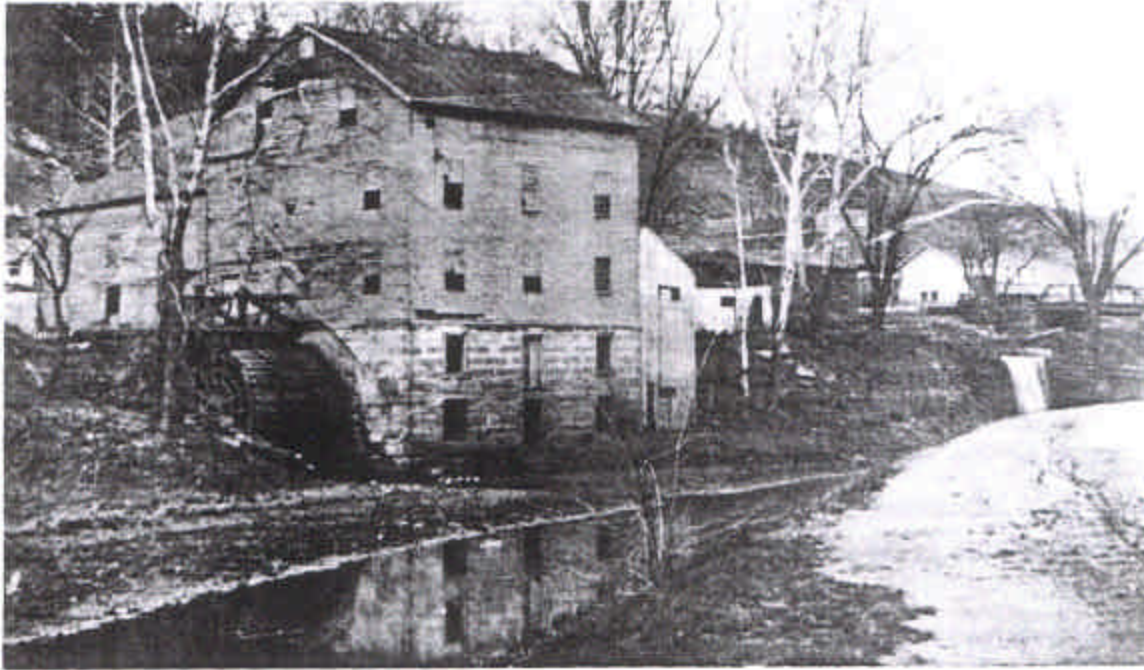
Union Mills, Circa 1898