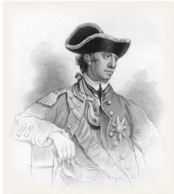
General Sir William Howe