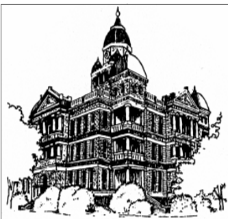
1896- Denton County Courthouse-1996

DENTON PUBLIC LIBRARY NORTH BRANCH 3020 N. LOCUST ST. DENTON, TEXAS