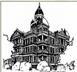
1896- Denton County Courthouse-

The Denton County Genealogical Society meets on the second Thursday during the months on September-November and January-May. 6:30 P.M.