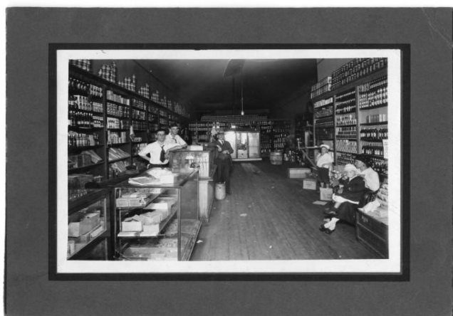
Leverett's Grocery, North Side of the Denton Courthouse Square

Remember to register for the “Genealogy After Hours” event to be held at the Emily Fowler Central Library on 23 February, 6:00 p.m.—11:00 p.m.