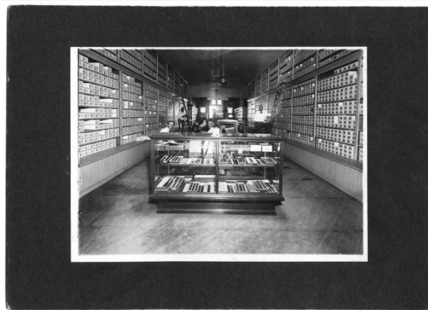
Beyette's Shoe Store, East Side of the Denton Courthouse Square