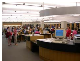
One of the Genealogy Reference Desks