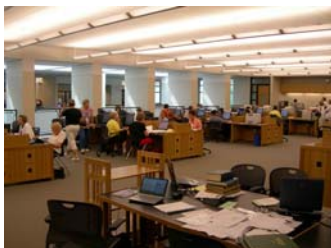
Genealogists researching their ancestors