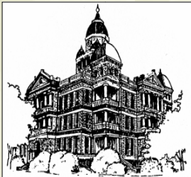
1896- Denton County Courthouse-

The Denton County Genealogical Society meets on the second Thursday during the months on September-November and January-May.