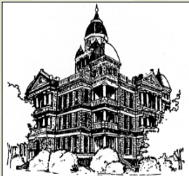
1896- Denton County Courthouse-