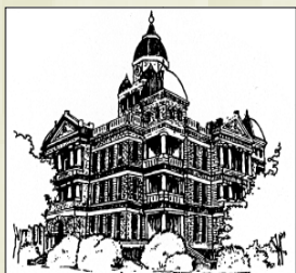
1896- Denton County Courthouse-

The Denton County Genealogical Society meets on the second Thursday during the months on September-November and January-May. 6:30 P.M.