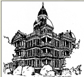
1896- Denton County Courthouse-

The Denton County Genealogical Society meets on the second Thursday during the months on September-November and January-May. 6:30 P.M.