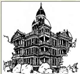
1896- Denton County Courthouse-

The Denton County Genealogical Society meets on the second Thursday during the months on September-November and January-May. 6:30 P.M.