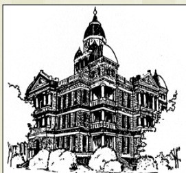
1896- Denton County Courthouse-

The Denton County Genealogical Society meets on the second Thursday during the months on September-November and January-May. 6:30 P.M.