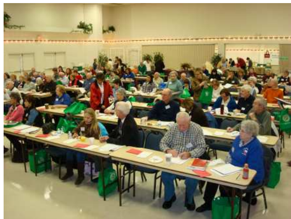
< Many hands filled the Tote Bags at The Place before the Seminar.