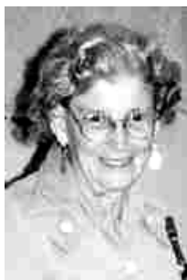
her private business.