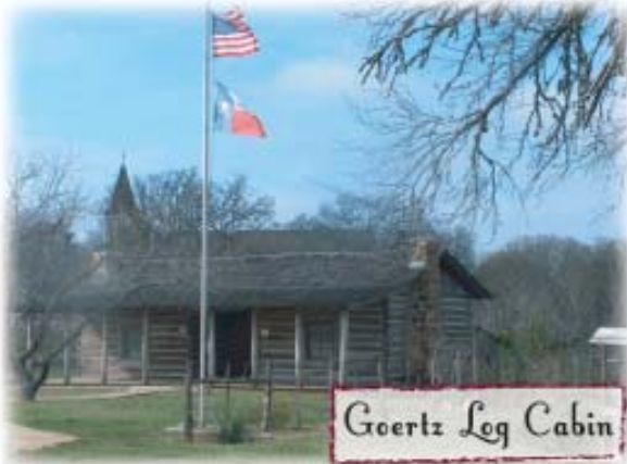
Goertz Log Cabin

Rockne Museum Dedicated on June 18, 2003