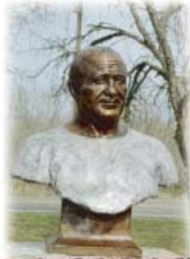
Knut Rockne Bust Dedicated in 2005