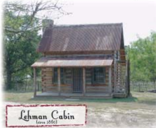
Lehman Cabin (c. 1860)