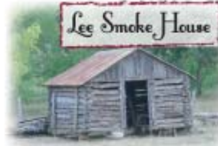
Lee Smoke House