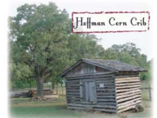
Hoffman Corn Crib