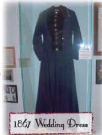
1867 Wedding Dress