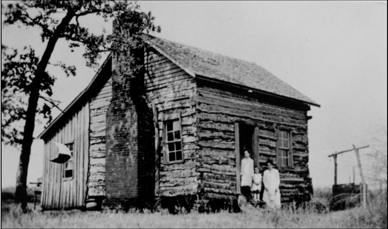
Bushong built this cabin in 1871, and lived in it until a larger house was finished nearby. The cabin still stands in Grapevine at 1617 Silverside, and, with additions, is still occupied.