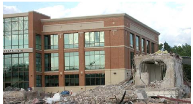
New Bank & Old Bank Vault on the right

One of the events scheduled for this area is part of the Luxemburg Centennial. The public is invited to a free corn roast and the Bob Rivers Band will entertain for the entire evening on Saturday, August 9 th in the Bank of Luxemburg parking lot. ■