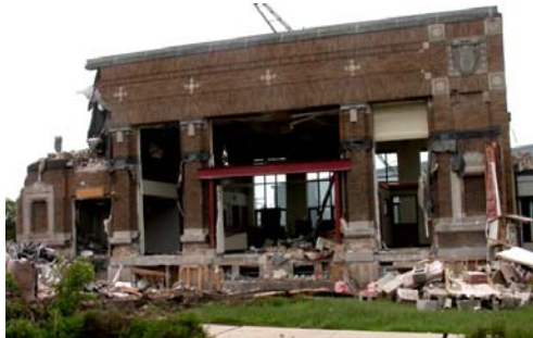
Demolition of Luxemburg Bank

Since then this bank has grown to include a number of branch banks located from East Green Bay over to Forestville in Door County. The number of employees has grown accordingly to offer the services required by a full service bank. Employees were working in a crowded basement and something needed to be done to provide additional space.