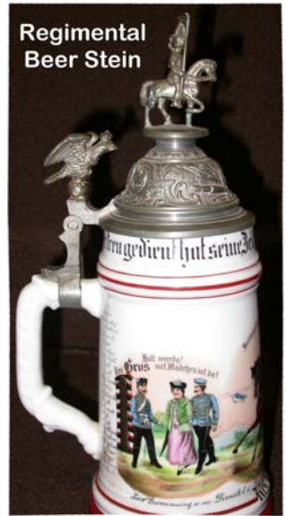
Regimental Beer Stein